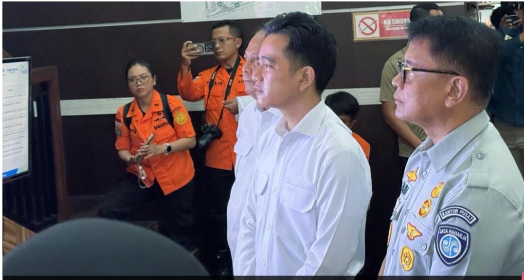
After the KMP Tunu Pratama Jaya sank in the Bali Strait, Jasa Raharja moved quickly to distribute compensation to the victims. (Kompas, July 3 2025)